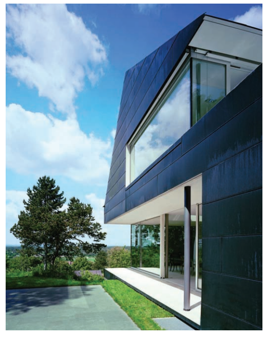
House in Seeheim, Germany; Architects: Fritsch und Schlüter Architekten.

Nordic Brown<sup>™</sup> products are pre-oxidised at Aurubis' factory to give straightaway the same oxidised brown surface that otherwise develops over time in the environment. The thickness of the oxide layer determines the colour: both Nordic Brown<sup>™</sup> Light and the darker Nordic Brown<sup>™</sup> versions are available.