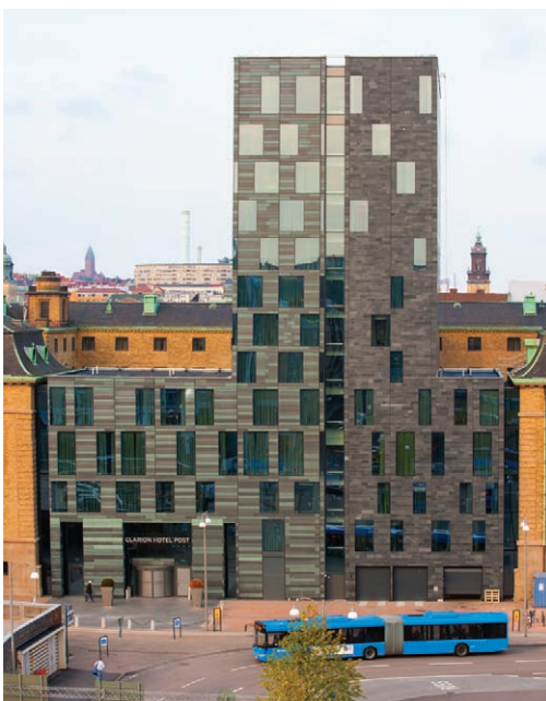
Clarion Hotel Post, Gothenburg, Sweden; Architects: Semrén and Månsson Architects

Nordic Green™ products offer designers unparalleled design freedom and the ability to determine the type and intensity of green patina for each project with choices of 'Living' surfaces. In a carefully controlled, factory process, pre-oxidised copper is treated with specifically formulated copper compounds to create the desired patina colours and heat-treated to chemically bind them to the copper.