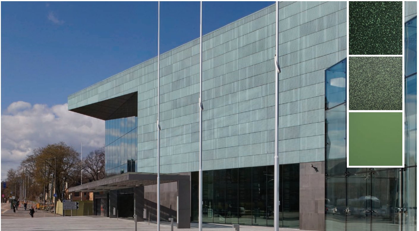
Helsinki Music Centre, Finland; Architects: LPR Architects.